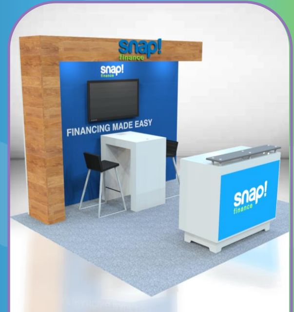
Personalize Your Booth